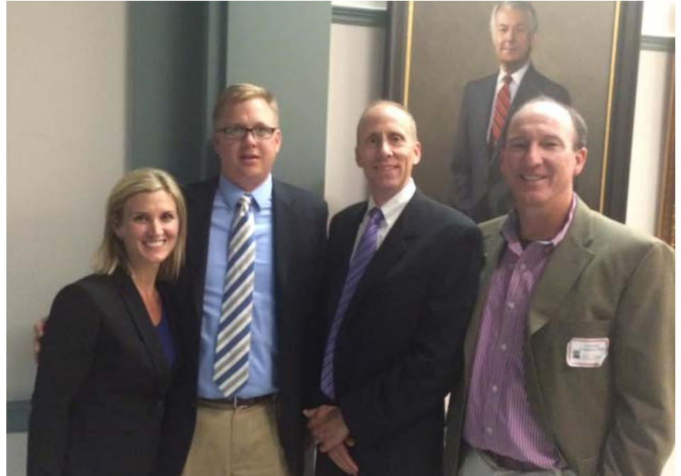
DPTA members at Legislative Hall in Dover immediately following the passage of House Bill 359. June 30, 2014.

2. Stricter Controls on Medical Costs: The Task Force recommended a 33% reduction in medical fees while implementing the reduction in over a period of 3 years. Twenty percent of the reduction would occur immediately, 5% after 1 year, and 8% after 2 years. The relative contribution of savings by provider types is still being negotiated, but it appears physical therapists will contribute somewhere in the neighborhood of 10% to 12% over 3 years. While this may seem substantial, surgeons will be contributing in the neighborhood of 40% savings. Additionally, the Task Force also recom-